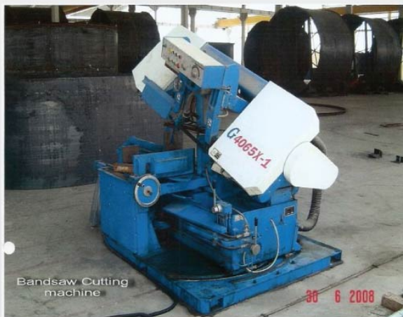
Band saw cutting Machine